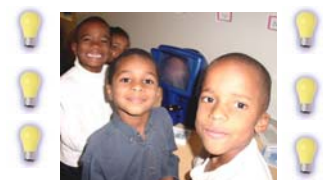
Students enjoying a science class at MLK Leadership Academy during Lights On 2006

For more information about the Lights On Afterschool! celebration, please contact the Office of Extended Learning at 616-819-2165.